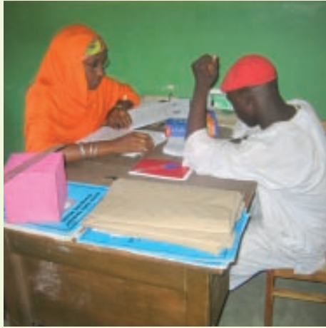
Above An enumerator practising the MLA procedure during a training programme.