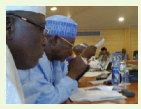
Right The Kwara MTSS team at the orientation workshop.