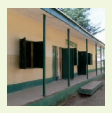
Above Improved planning will lead to an improved school environment.