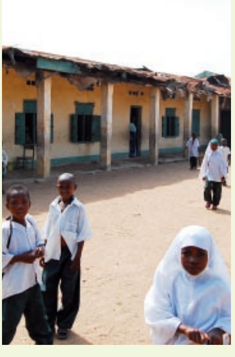
Above MTSS will lead to effective and efficient resource utilisation resulting in enhanced service delivery.

In most of the states, there is a strong appetite in the central agencies (Finance, Planning and Accountant General's office) to extend the MTSS process to other key ministries in the near future, as part of a State Government-wide reform of budget cycle management. However the states lack the capacity to advance such a reform rapidly in the absence of technical support. Going forward, State Partnership for Accountability, Responsiveness and Capability (SPARC) will be carrying out advocacy and sensitization for policy makers on Medium-Term Expenditure Framework (MTEF) and MTSS processes and will also work to develop a set of outline formats to go out from Ministeries of Economic Planning (MoEPs) to all relevant sector MDAs, so that all sectors are encouraged to contribute strategic thinking to their sector plans.