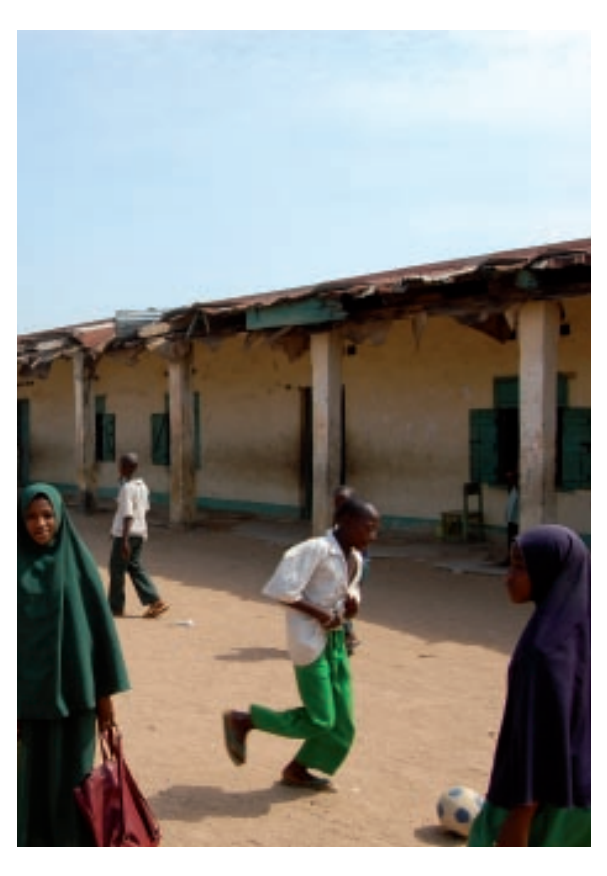
Above MTSS will lead to effective and efficient resource utilisation resulting in enhanced service delivery.