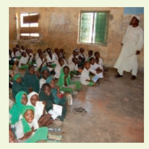
Above MTSS will bring about improved teacher development and education quality.